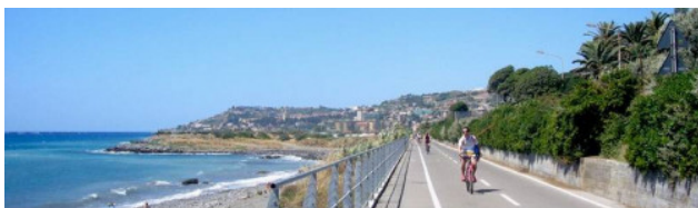
Pista Ciclabile del parco costiero della Riviera dei Fiori