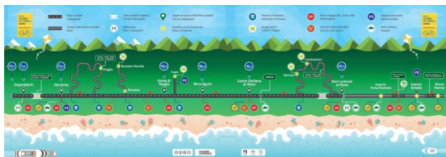
Pista Ciclabile del parco costiero della Riviera dei Fiori